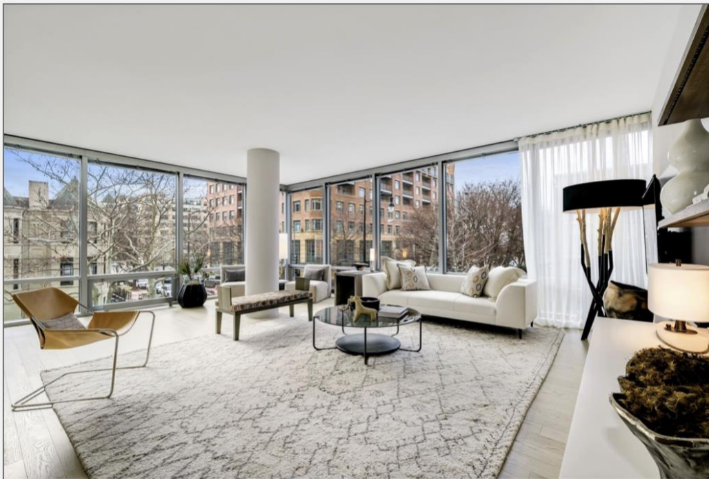
A view of a light-filled living room space at Westlight Condominiums .

The five-star, chef-style kitchens feature custom Italian high-gloss cabinetry, Caesarstone quartzite countertops, natural gas cooktops, and integrated Bosch and Thermador appliances. With each home's separate ventilation system, filtering all kitchen smells outdoors, Westlight owners can control virtually every aspect of their living environment.