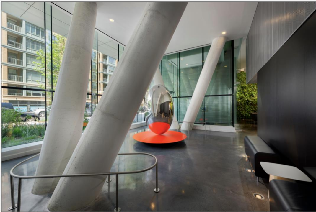
A view of the exquisite lobby at Westlight Condominiums .

The state-of-the-art acoustic details at Westlight also sets it apart from other luxury condos in the city. The unique insulation design between homes coupled with floor-to-ceiling triple-glazed sound dampening windows ensures that every residence will truly be a quiet sanctuary steps from national monuments, Georgetown, and the Potomac River.