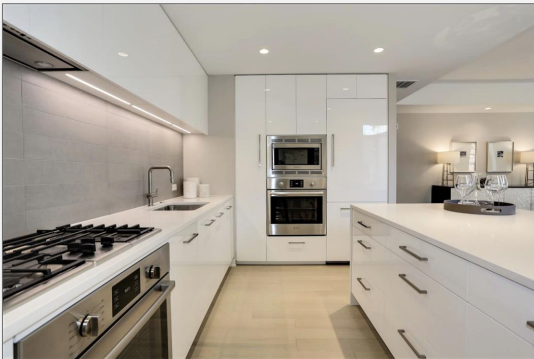
A view of the five-star kitchen at Westlight Condominiums .

The five-star, chef-style kitchens feature custom Italian high-gloss cabinetry, Caesarstone quartzite countertops, natural gas cooktops, and integrated Bosch and Thermador appliances. With each home's separate ventilation system, filtering all kitchen smells outdoors, Westlight owners can control virtually every aspect of their living environment.