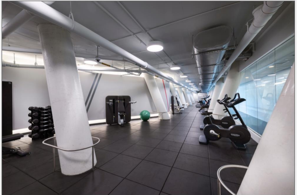
A view of the state-of-the-art fitness center at Westlight Condominiums .

Westlight also offers a host of high-end building amenities, including access controlled underground parking, private meeting room, clubroom with catering kitchen, and a cutting-edge, high-tech fitness center with Peloton bikes.