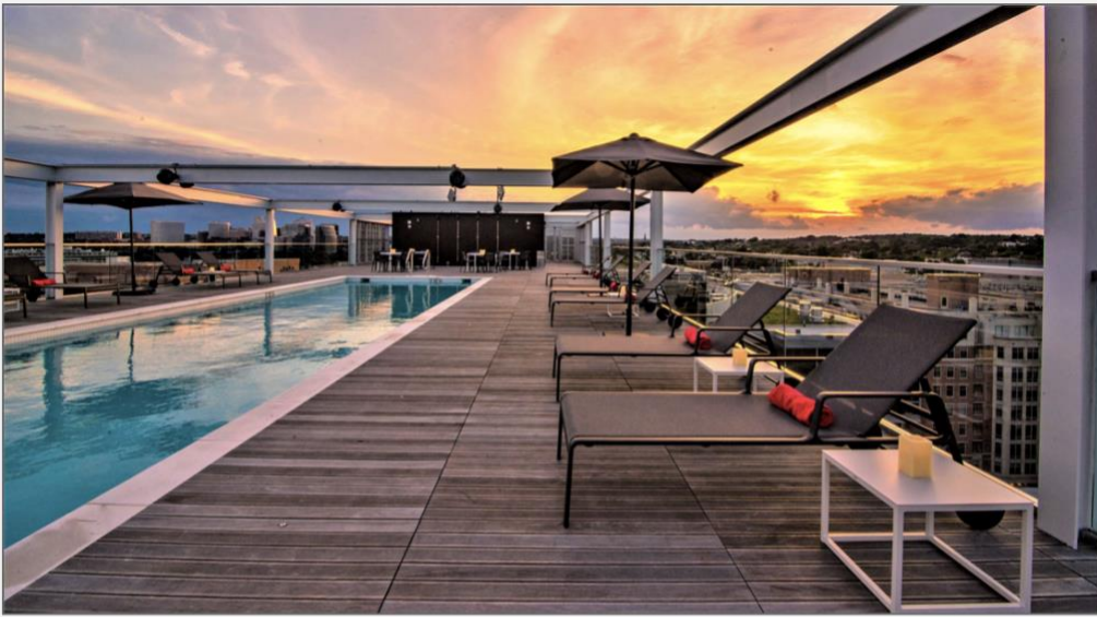
A view of the heated rooftop pool at Westlight Condominiums .

The rooftop features DC's only 25-meter heated rooftop pool and outdoor grill terrace with separate seating spaces offering breathtaking panoramic views of the city.